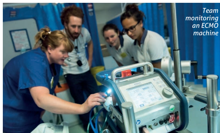
Team monitoring an ECMO machine

Having gone from strength to strength, the service has expanded even further to provide more cardiac ECMO for patients suffering cardiogenic shock (a condition where the heart is suddenly unable to pump enough blood to meet the body's needs).