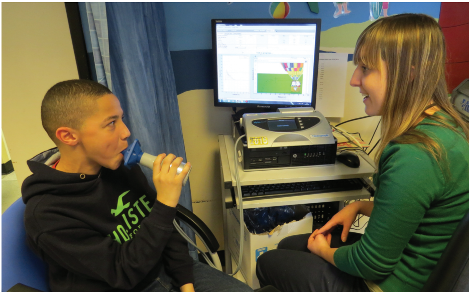
A child using a spirometer

These tests are not painful, but can cause an itchy rash that lasts up to 30 minutes.